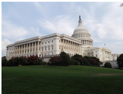
ChatGPT's exec took a walk on the Senate side.