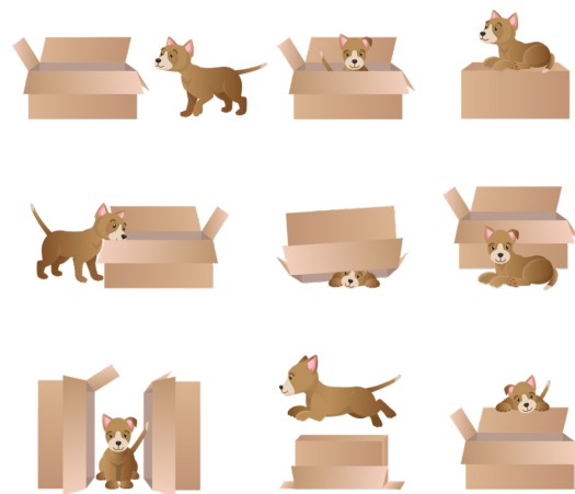
Who remembers The Preposition Fox? :D

Attitudes toward prepositions have changed since those exasperating days. It's OK to end a sentence with over, under, and any other preposition, according to Grammar Girl, who calls this outdated rule a Top 10 Grammar Myth .