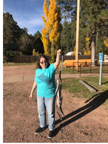
My fishing haul from Woods Canyon Lake, AZ

A cybercriminal group called TA577 uses updated Qbot malware that opens emails and steals data within seconds of infecting Outlook.