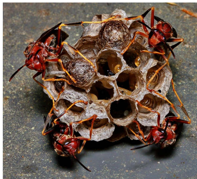
The Hive: Worse than the Borg?

The Federal Bureau of Investigation seized this site as part of coordinated law enforcement action taken against Hive Ransomware.