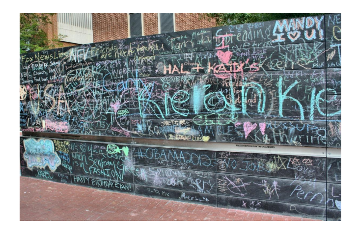
Avoid cramming in too many words.

Use bullet points or numbers when you have a list. Limit your lists to five points and two lines for each one.